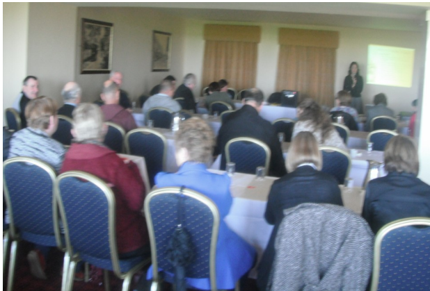
Group listening to the Health Talk

The discussion topic "How would current students encourage another person to return to Education" was a very interactive session there was great learning from the feedback.