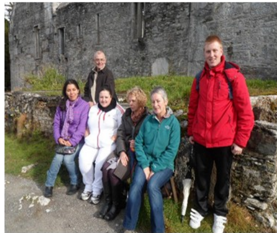
Group relaxing in front of Abbey

Muckross House and Gardens was the next item on our itinerary. We walked from Muckross Abbey to Muckross House. We all enjoyed our lunch in The Garden Restaurant before our tour of Muckross House. The tour of Muckross House was amazing and the highlight of our outing. Lots of photographs were taken which will be used for the group's PhotoStory projects and photographic evidence worksheets.