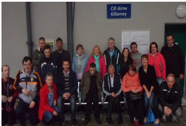
Waiting for the train that never came...

On the 17 th October, 2013, twenty five learners travelled to Tralee. Our first stop was a visit to the Tralee ABE Centre. We then visited the Kerry County Museum followed by lunch at Finnegan's. Some learners particularly enjoyed visiting the Tom Crean Room as they had spent time researching and learning about this Antarctic Explorer with their tutor. All the learners thoroughly enjoyed the outing. Sincere thanks to NALA for providing funding to allow us to go on learner outings. These outings are invaluable for both learners and tutors. It has enhanced our learners' experience and it is wonderful to see the learners engage in activities outside of the classroom environment.