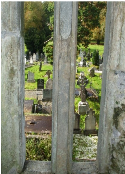
View of graveyard from Abbey

We then walked to Muckross Abbey and explored the abbey and graveyard. During our sessions we had researched about the history of the abbey. We had lots of photo opportunities here and thankfully weather was kind to us.